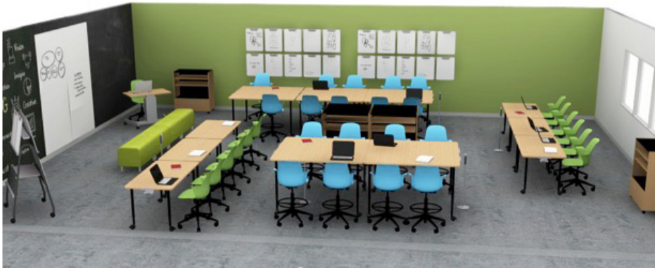
(Computers not included)