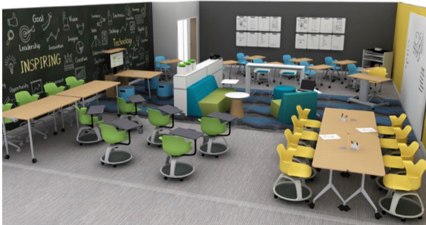
(Computers and monitor not included)