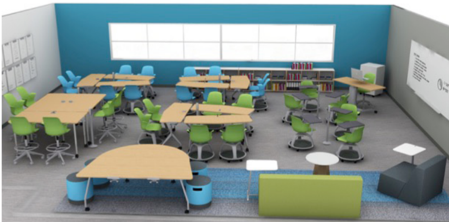
(Computers not included)