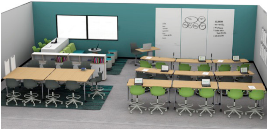
(Computers not included)